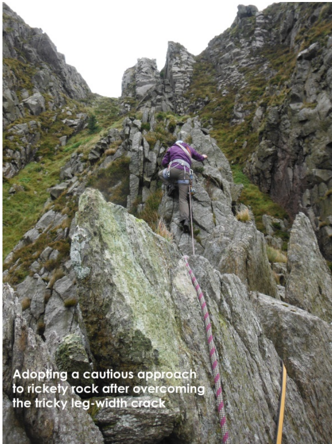
Adopting a cautious approach to rickety rock after overcoming the tricky leg-width crack